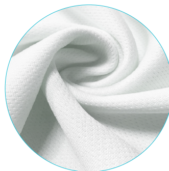
C | Coolmax® micro bird eye