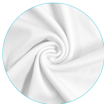
A | Single jersey polyester